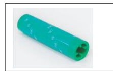
Cleaning roll 4 rolls per box