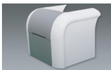
Flip over module