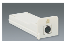
Smart card encoder module