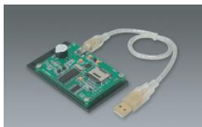
Mifare A&B encoder module