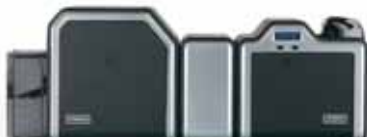
Lamination option and dual-sided printer/encoder

Modular design grows with your needs. Not sure what your ID card applications will require in the future? No problem. The HDP5000 is easily upgraded to fit your needs. Start with a basic single-sided unit. Install encoding modules. Upgrade to dual-sided printing. Add lamination, or simultaneous dual-sided lamination for the ultimate in card security and durability.